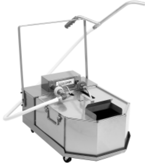
Model FFM80 shown

180 North Anets Drive • Northbrook, Illinois 60062 • 847-272-0770 • Fax 847-272-1943 For ANETS Factory Warranty Service • 800-837-2638